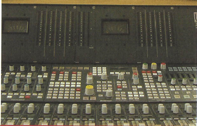
The audio production control room at Meridian

regional programming. TSL is also responsible for the five non-linear edit suites, master equipment room, and there will be a new, integrated newsroom system based around iNews/Avid technology.